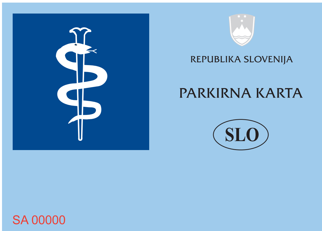
Prednja stran obrazca